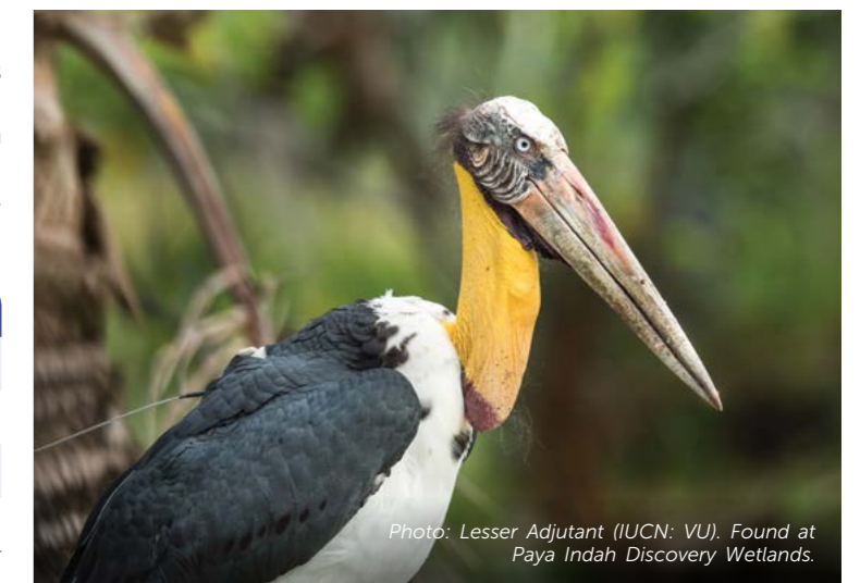
Photo: Lesser Adjutant (IUCN: VU). Found at Paya Indah Discovery Wetlands.